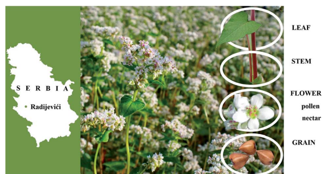
Fig. 1 Buckwheat samples (leaf, stem, flower, grain, pollen, nectar) collected in Serbia, Nova Varoš, Radijevići (43°23'31" N; 19°52'20" E).

All samples were taken from the buckwheat plant ( Fagopyrum esculentum Moench) species ‘Novosadska’ cultivated in a small locality in Western Serbia, in a village Radijevići (43°23'31" N, 19°52'20" E) (Fig. 1). Samples were harvested at the flowering season of buckwheat during the full nectar secretion, in July 2017. Buckwheat plant organs such as leaf, stem, flower, and