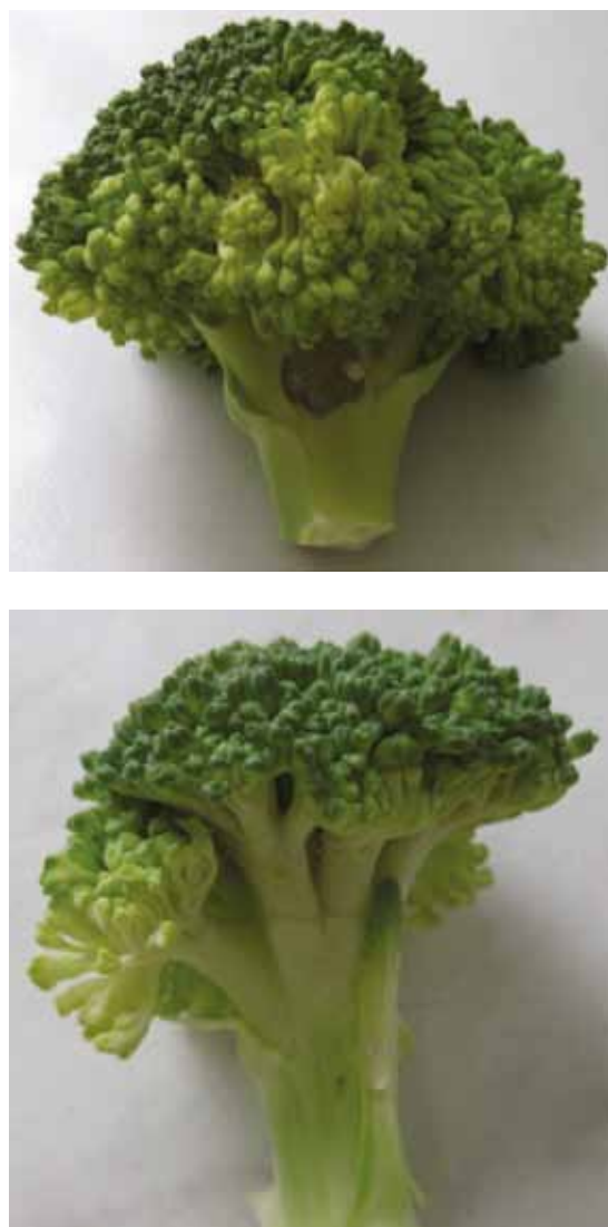
Figure 1. Pathogenicity assay. Tissue discoloration and soft rot of broccoli floret inoculated with one of the studied strains (above), and no symptoms developed on negative control (below) 48 h after inoculation.

Symptoms of tissue discoloration and soft rot of broccoli florets developed within 48 to 72 h after inoculation (Figure 1). No symptoms developed on control florets. Soft rot appeared on the inoculated carrot and potato tuber slices 24 h after inoculation, indicating a strong pectolytic activity of the studied strains. The strains did not induce hypersensitive reaction on tobacco leaves.