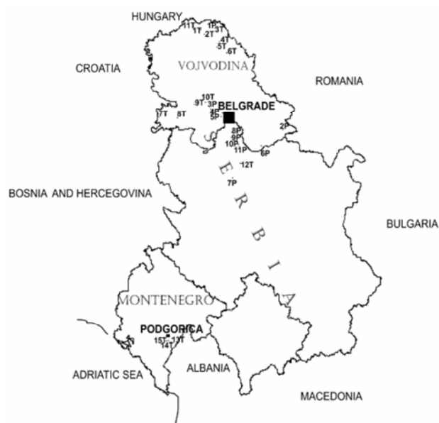
Fig. 1. Collection sites and host – plants of Myzus persicae in Serbia and Montenegro.

One-way MANOVA was used to examine the effects of the host-plant on M. persicae morphological variation. The fixed factors were the two host-plants (peach and tobacco). When the MANOVA was statistically significant, subsequent