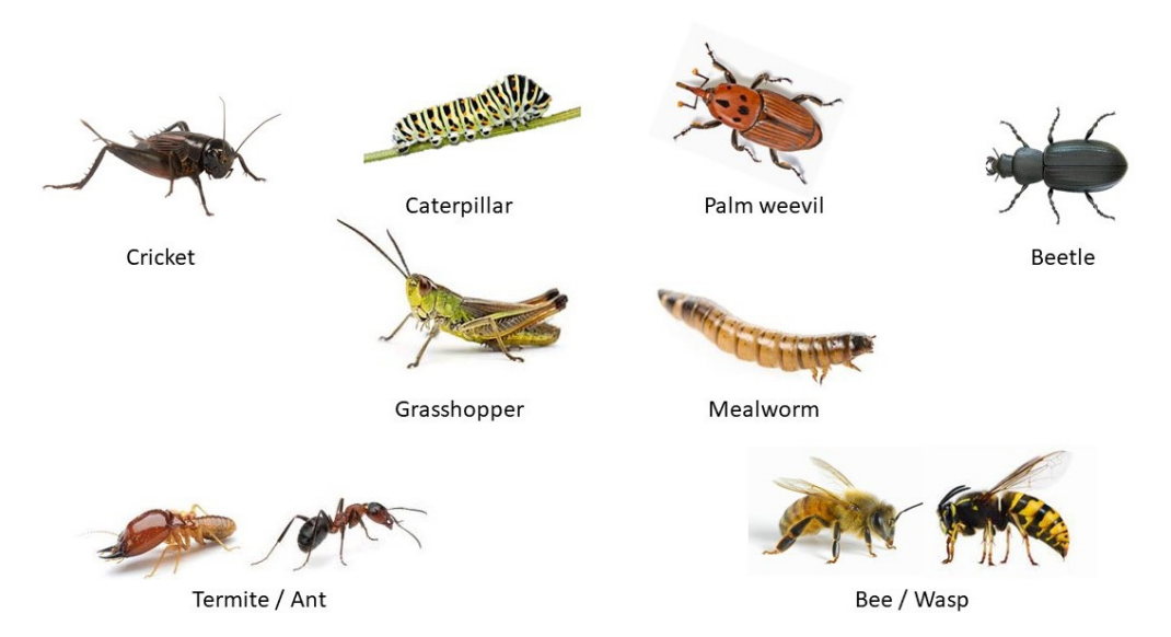
Figure 1. Some of the world's common edible insects.