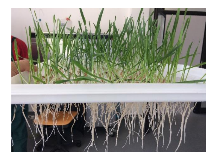
Photo 2. Ten-day old seedlings after the growth in the growth chamber

seedling was scanned, after which photographs were processed and the following root system traits were measured: primary root length, the number of seminal roots, length of each seminal root using the computer-adapted program - ImageJ (Rasband, W.S., ImageJ, U. S. National Institutes of Health, Bethesda, Maryland, USA, https://imagej.nih.gov/ij/, 1997-2018). After roots were scanned and the stem lengths were measured, the plant material was placed into paper bags and dried in the thermostat at the temperature of 80°C for 24h. After 24h, dry weight of stems and roots was measured on an analytical balance.