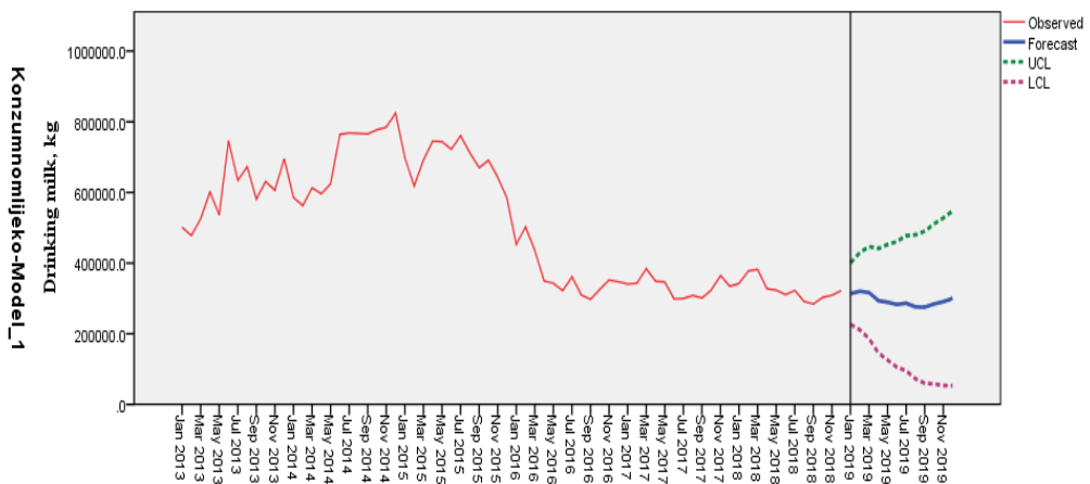
Figure 3. Tendencies in production of observed and forecasted quantities of drinking milk