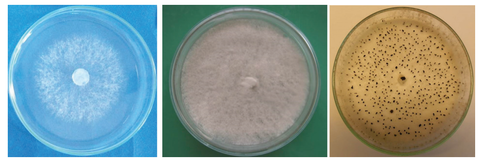
Figure 3. Botrytis squamosa. White uniform aerial mycelium with entire margin after incubation at 20°C for 3 days (left); Mycelial type of isolate after 10 days of incubation (central); Sclerotial type of isolate after 10 days of incubation (right)