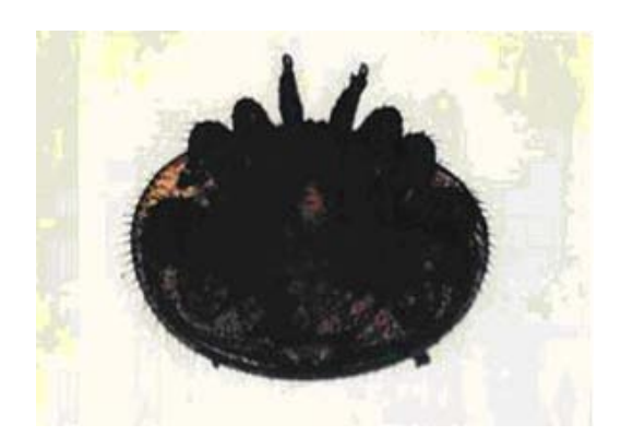
Figure 1. Varroa destructor, an ectoparasite of bees 200 x (Bojanić Rašović)

This parasite causes great damage to beekeeping in Montenegro. It provokes varroosis, the disease of bees and their brood. This parasite is present throughout the year in bee colonies by feeding on hemolymphs from bees, larvae and pupae. Direct damage from this parasite is the result of sucking the hemolymph of bees and is manifested by weakening and dying of bees (Anon., 2014; Lolin, 1991). The weakening of the immunity of bees