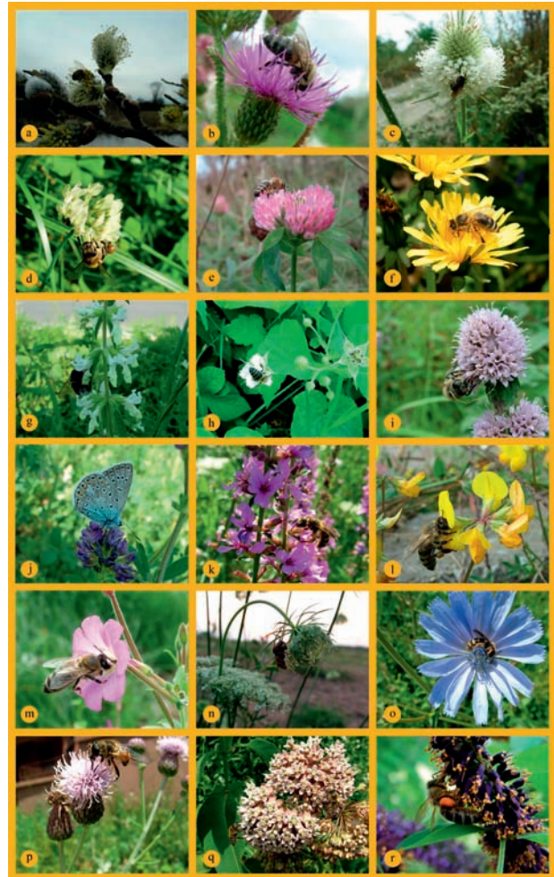
Fig. 3. The main plant contributors to melliferous potential of the research area of Vojvodina: Salix caprea (a), Carduus acanthoides (b), Dipsacus laciniatus (c), Trifolium repens (d), Trifolium pratense (e), Taraxacum officinale (f), Stachys annua (g), Rubus caesius (h), Mentha aquatica (i), Medicago sativa (j), Lythrum salicaria (k), Lotus corniculatus (l), Epilobium hirsutum (m), Daucus carota (n), Cichorium intybus (o), Cirsium arvense (p), Asclepias syriaca (q), Amorpha fruticosa (r).

Ruderal vegetation is commonly found growing on meadows and embankments (ass. Asclepietum syriacae ), alongside roads and in abandoned areas (ass. Chenopodio-Ambrosietum artemisiifoliae ), as well as at drainage-canal habitats (ass. Amorpho-Typhaetum ). The diversity of weed flora was the greatest in this type of vegetation.