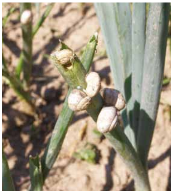
Figure 3. Bites and infiltration of white snails into green onion leaves

The most complete data on damage caused by white snails were collected in a study of introduced invasive populations in South Australia (Baker, 1986, 1996, 2002; Barker, 2002; Leonard et al, 2003). White snail causes significant economic damage on cereals in that country, developing populations of such density that yields are reduced, harvest machinery suffers clogging and grain becomes polluted. Besides, it damages seedlings of wheat, barley, oleiferous crops, carrot, annual medicinal plants, alfalfa, clover, pea, bean and ornamentals. On artificial pastures, cattle are repelled from grazing plants with contaminated slimy deposits. In the United States (Michalak, 2010; White-McLean, 2011), C. (C.) virgata is considered an important pest of cereals and nursery plants, a cause of contamination of cereal grains and damage of harvest machinery. Cereal pollution is caused by increased moisture during storage and stimulation of secondary infections with pathogens that release toxins.