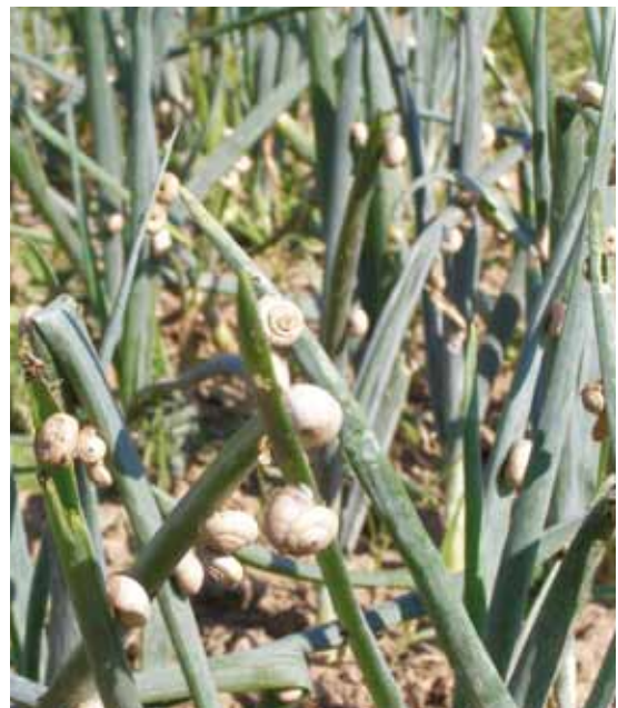
Figure 2. White snails on green onions

In our study, we observed large aggregations of C. (C.) virgata in the inspected vegetable plots, but snails were nonselectively present also in the surrounding areas, on ornamentals, fruit trees and densely packed along columns and fences. On a majority of infested plant species (e.g. potato, raspberry or rosemary) no visible feeding marks were found or chlorosis caused by aggregated snails. Negligible damage was found on pumpkins, cucumbers and beans. On the other hand, damage on green onions was more extensive and found on 80-95% of inspected plants. Besides an assumed pollution of green onions with excrements and slime that is not readily soluble in water, the plants were further damaged by biting and shortening of terminal green leaves. Interior leaf parts were additionally polluted by snails that got into the hollow leaves through bitten holes. Snails did not damage plants totally but the extent of biting and pollution rendered them unacceptable for consumption and sale.