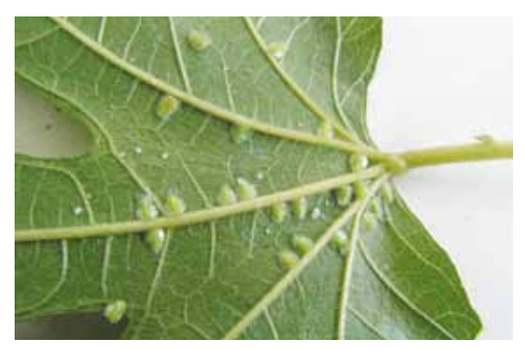
Figure 7. Larvae of Homotoma ficus on lower side of leaf Ficus carica (original)