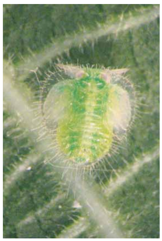
Figure 6. Fifth instar nymph of Homotoma ficus L. (original)

Localities. Dobanovci (DQ3789263688, 80 m) (May 11, 2008 (L<sub>3</sub>), Novi Sad – Liman (DR1009911412, 80 m) (June 9, 2008 ( L_5 , 4^{\bigcirc}_+ , 1^{\bigcirc}_- ), October 2, 2008, (eggs, 1^{\circ}_{\downarrow} ), May 15, 2009 (L<sub>3</sub>)). Belgrade region: Voždovac (DQ5842859541, 85 m) (April 25, 2007 (L<sub>3</sub>), May 3, 2007 (L<sub>4</sub>, L<sub>5</sub>), May 26, 2007 (L<sub>5</sub>, 12^{\bigcirc}_{+} , 9^{\land}_{\circ} ), February 27, 2008 (eggs), March 14, 2008 (eggs), October 21, 2008 (eggs, 5♀, 1♂)), Šumice (DQ5958159159, 85 m) (May 24, 2007 (L<sub>3</sub>)), Zemunski kej (DQ5437563864, 77 m) (May 10, 2007 (L<sub>3</sub>), May 16, 2007 (L<sub>4</sub>, L<sub>5</sub>), June 21, 2007 (L<sub>5</sub>), July 18, 2007 (3♀, 3♂), September 20, 2007 (5^{\bigcirc}_{+}, 3^{\bigcirc}_{0}, \text{eggs}) , October 8, 2007 (eggs), March 26, 2008 (eggs, L<sub>1</sub>), April 7, 2008 (eggs, L<sub>1</sub>), May 15, 2008 (L<sub>3</sub>), May 30, 2008, October 19, 2008 (eggs, 3^{\bigcirc}_{+}, 3^{\bigcirc}_{-} ), May 18, 2009 (L<sub>3</sub>, L<sub>4</sub>), June 25, 2009 (L<sub>5</sub>, 4^{\bigcirc} , 3^{\wedge} )), Nova Galenika (DQ5021567776, 90 m) (May 9, 2007 (L<sub>3</sub>)), Lazareviceva street (DQ5779861931, 125 m) (May 25, 2007 (L<sub>5</sub>)), Studentski grad (DQ5245563671, 80 m)