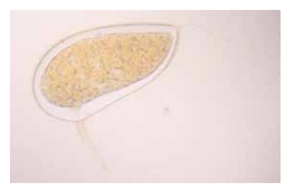
Figure 5. Egg of Homotoma ficus L. (original)

Fifth instar larva measurements (in mm). Body length (BL): 2.48-2.51; body width (BW): 2.28-2.44; antenna length (AL): 0.69-0.70; fore wing pad length (FL): 1.22-1.96; metatibiotarsus length: 0.57-0.58; caudal plate length (CL): 0.69-0.78; caudal plate width (CW): 1.09-1.22; circumanal ring width (RW): 0.32-0.35.