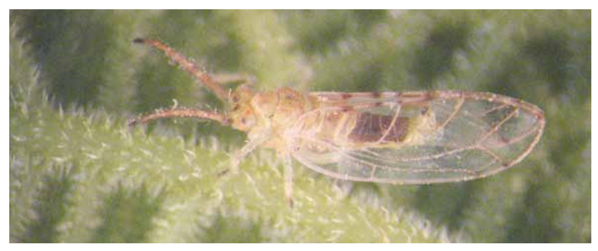
Figure 3. Adult male of Homotoma ficus L. (original)

Adult measurements (in mm). Male: body length (BL): 3.25 to 3.55; head width (HW): 0.73-0.75; antenna (AL): 1.62-1.67; fore wing length (WL): 3.86-3.90; fore wing width (WW): 1.38-1.42; metatibia length (TL): 0.82-0.81; male proctiger length: 0.40-0.41; paramere length (PL): 0.29-0.37; distal segment of aedeagus length (DL): 0.32-0.39. Female (BL): 3.50-3.80; HW: 0.77-0.82; AL: 1.55-1.60; WL: 3.52-3.76; WW: