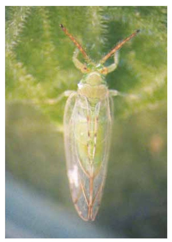
Figure 2. Adult female of Homotoma ficus L. (original)

Adult. Body light green in freshly moulted specimens, later becoming darker, light green-brown (Figure 2) to yellow-brown with dark brown abdominal tergites (Figure 3). Antennae densely covered with long setae, light brown, segments 9-10 dark brown (Figure 4b). Forewing apically angular; membrane transparent; veins bearing numerous conspicuous setae, light brown with dark brown spots on apices of veins M_{1+2} , M_{3+4} , Cu_{1a} and Cu_{1b} , and two spots on anal vein. Male terminalia with proctiger bipartite and paramere relatively narrow and parallel-sided, apically slightly turned posteriad (Figure 4d). Female terminalia relatively long, proctiger and subgenital plate apically subacute (Figure 4e).