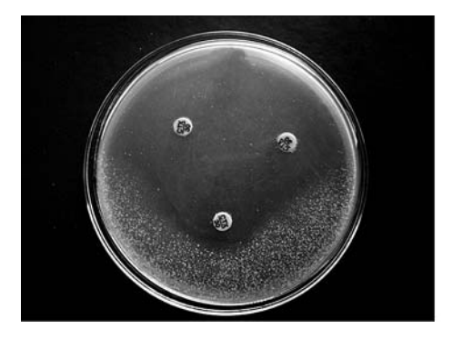
Fig. 1 — Inhibitory effect of Thymus vulgaris ethereal oil (pure oil) on the growth of Enterococcus faecalis ATCC 29212