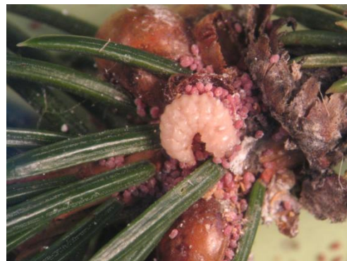
Fig. 8. Larva of A. nebulosus