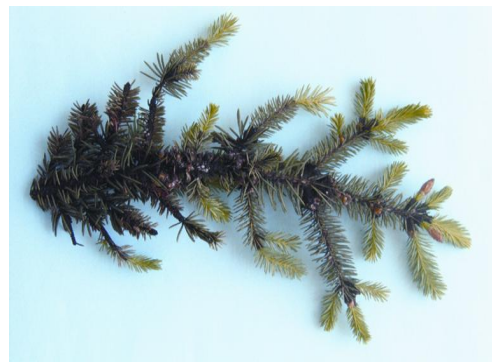
Fig. 6. Branches covered with sooty mold