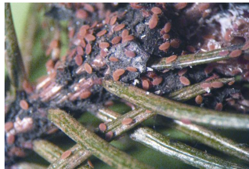
Fig. 4. First instar larvae