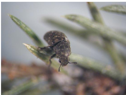
Fig. 7. Anthribus nebulosus