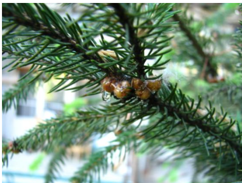
Fig. 5. P. abies covered with honeydew