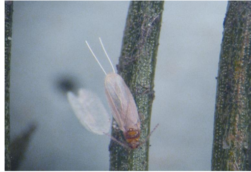
Fig. 2. Male