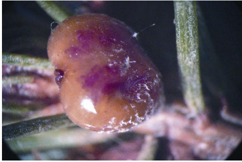
Fig. 1. Female