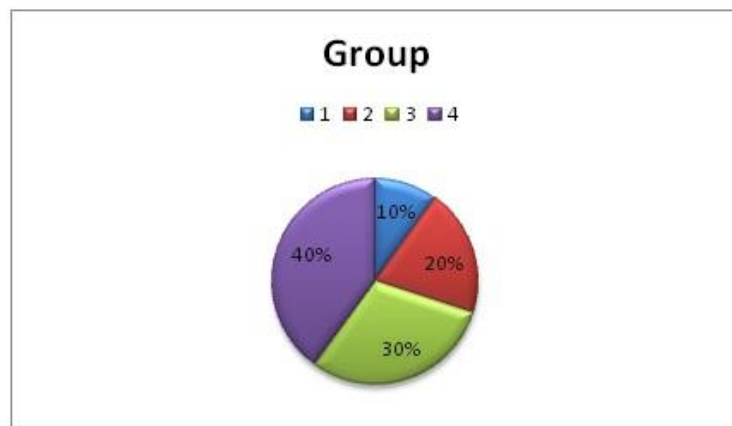
Figure 1 Division of tested orchard sprayers according to the impact of the exploitation period