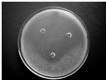
Fig. 1. - Inhibitory effect of Majorana hortensis essential oil (ratio 2:1) on the growth of Listeria Monocytogenes ATCC 19115