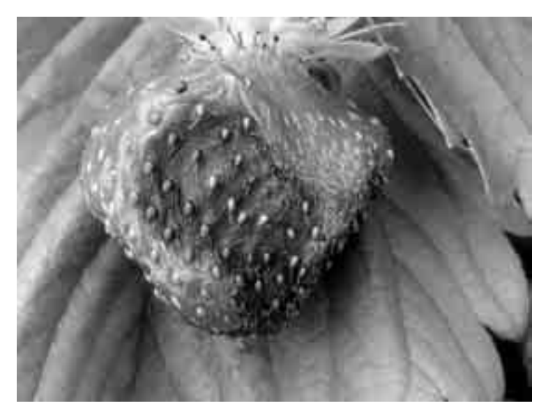
Fig. 2 — Typical anthracnose lesion on ripen strawberry fruit

white later becoming orange, then turning into greenish grey as the cultures aged and later became covered with pink to salmon conidial masses on PDA. Light orange spore masses were formed around the centre of the colony. Older cultures developed black acervuli in the centre of the colony.