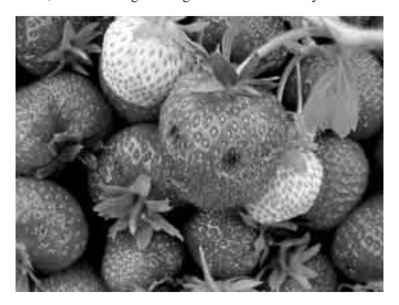
Fig. 1 — Water-soaked lesion on strawberry fruit caused by C. acutatum

Diseases symptoms . The most visible symptoms of anthracnose on strawberry were on fruits at maturation. At the beginning infected fruit form of brown, circular, sunken, initially water-soaked lesion ( Figure 1). Under optimal temperature (25°C) and humidity they rapidly increased, giving lesion of 1 to 2 cm in diameter within 3 to 4 days ( Figure 2). With warm weather the disease spreads fast causing fruit rotting. The symptoms on vegetative parts of plants, stolons, leaves during the vegetation were unlikely to be seen.